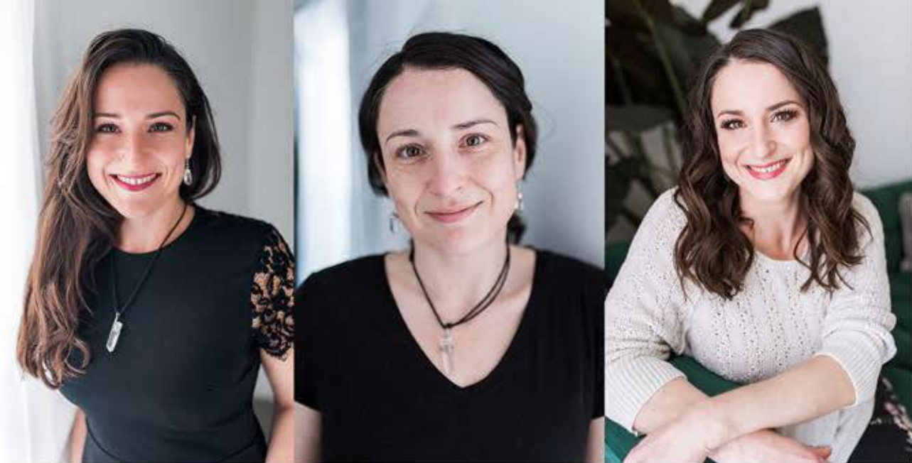
Client did own hair + makeup